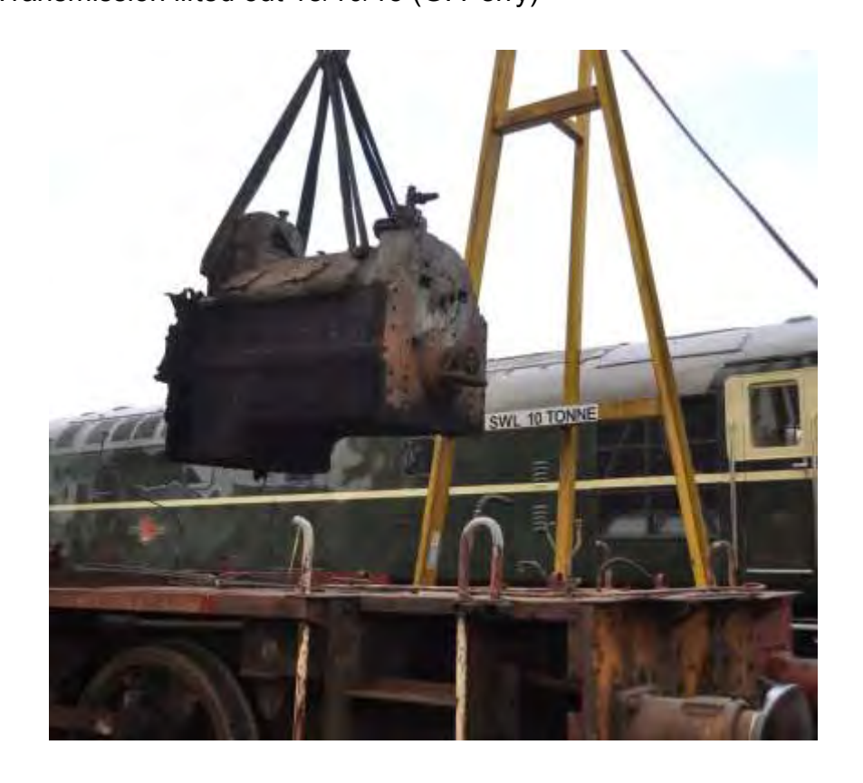
Page 11 of 12 ©DEPG w1

Voith Transmission lifted out 18/10/15 (G. Perry)