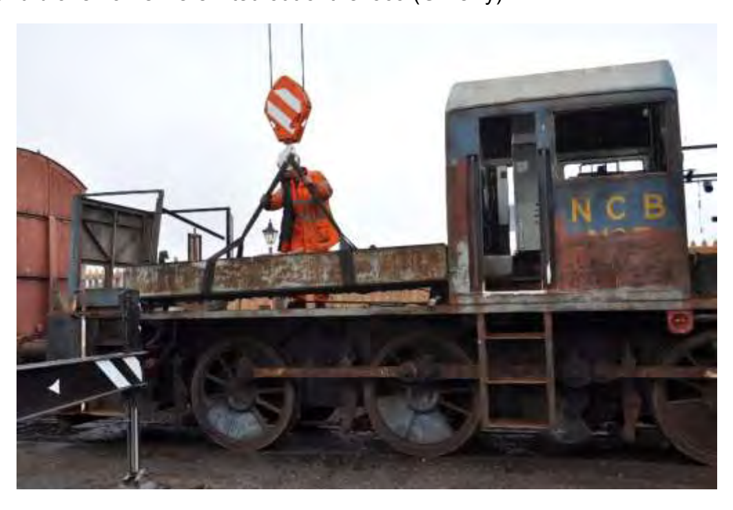
Page 9 of 12 ©DEPG w1

Opportunity was taken to use a road mobile crane11/12/14 and the two fuel tanks, control cubicle and brake frame were lifted out of the loco (G.Perry)