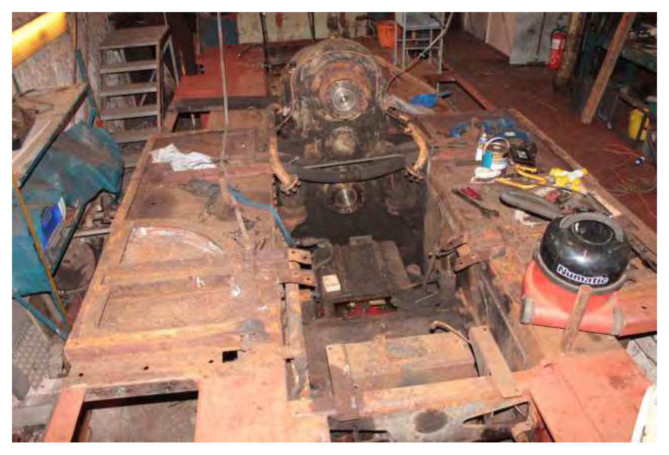
Attention being given to final drive reversing gear 29/08/15 (Terry Deacon)

The rear 'nose end' was also taken off at this time