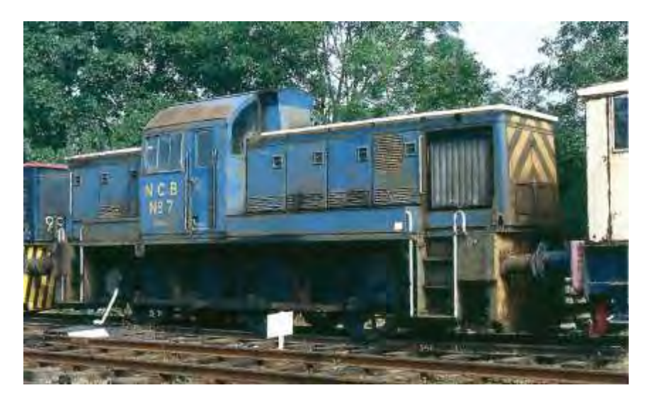
NCB No7 at Rutland Railway Museum 16/08/90 (G. Kobish)

26/09/87 Moved by road to Rutland Railway Museum. Remaining as a static exhibit, Parts removed to reinstate D9555.