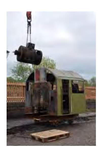
Followed by the generator. This will need sending away for specialist repair before refitting.