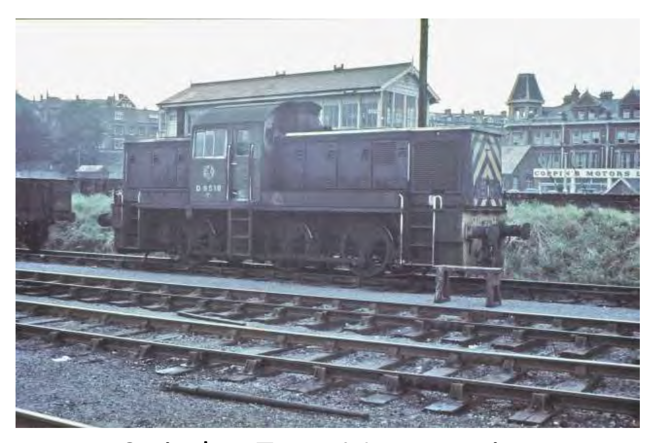
Swindon Type 1 Locomotive 1964 to 2015