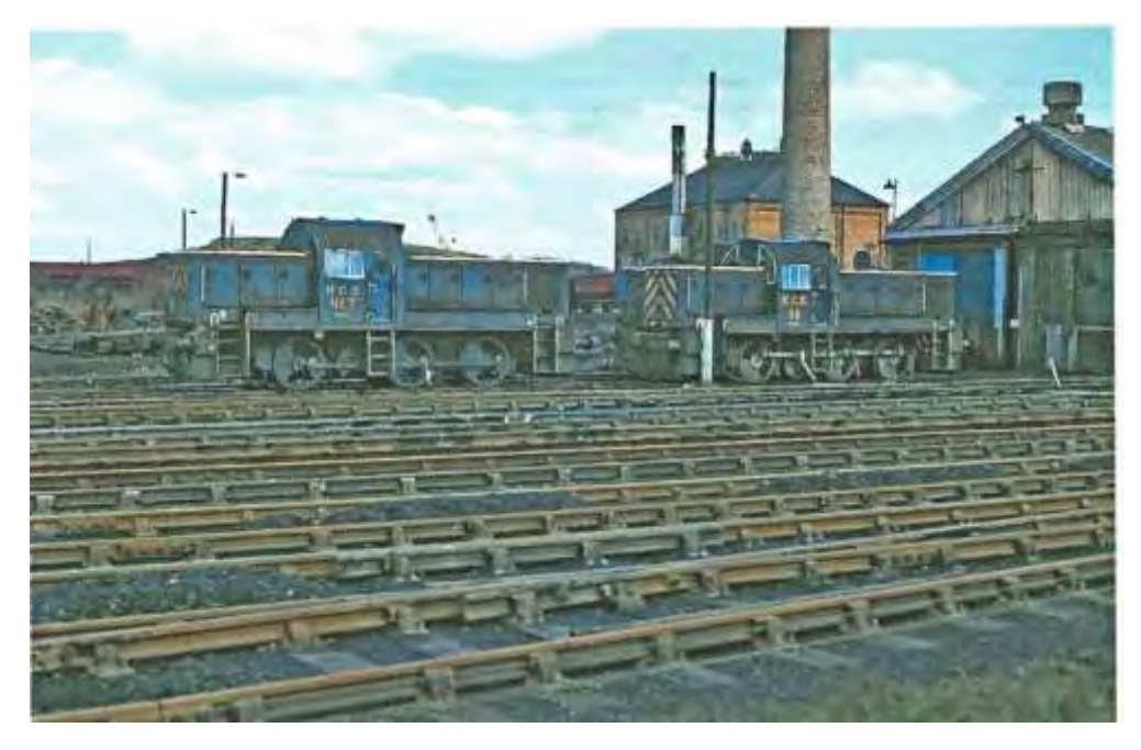
NCB No 7 (9518) and NCB 38 (D9513) at Ashington 04/81 (D.Ford)

29/08/80 To Lambton Engine works, New tyres fitted and overhaul 05/12/80 Returned to Ashington.