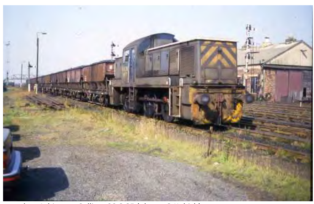
NCB No. 7 at work at Ashington Colliery 30.8.85

22/07/86 Withdrawn for power unit change, New engine fitted but due to oil leaks engine removed for rectification work. – Never refitted due to Miner's Strike