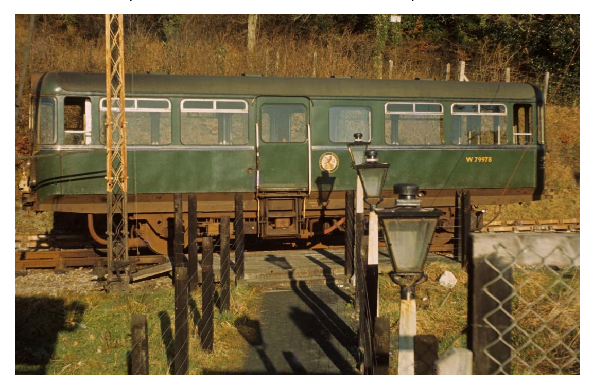
W79978 at Boscarne Exchange platform on 15<sup>th</sup> December 1966

And finally for this month, W79978 in British Railways service,