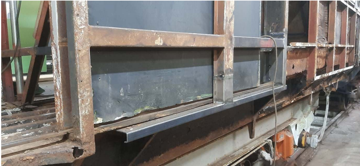
Replacement section welded in place. Also visible are repair sections on two of the bodyside vertical pillars and a horizontal brace which has been replaced.