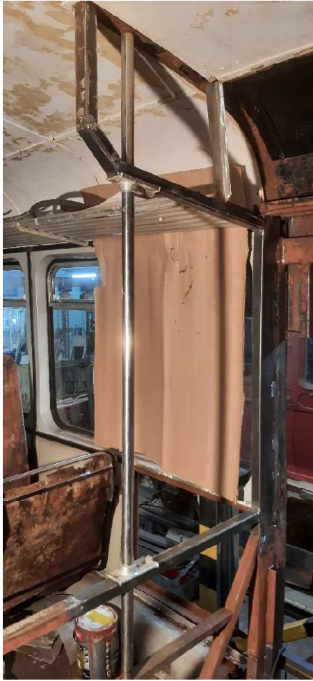
Interior partition frame and bodyside support pillar. Several new sections of steel are visible.