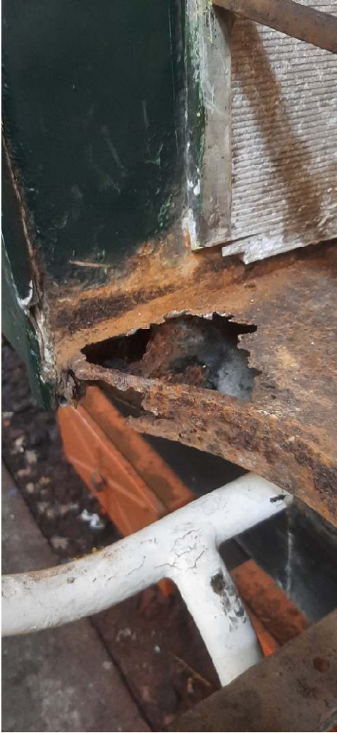
Doorstep frame before repair.