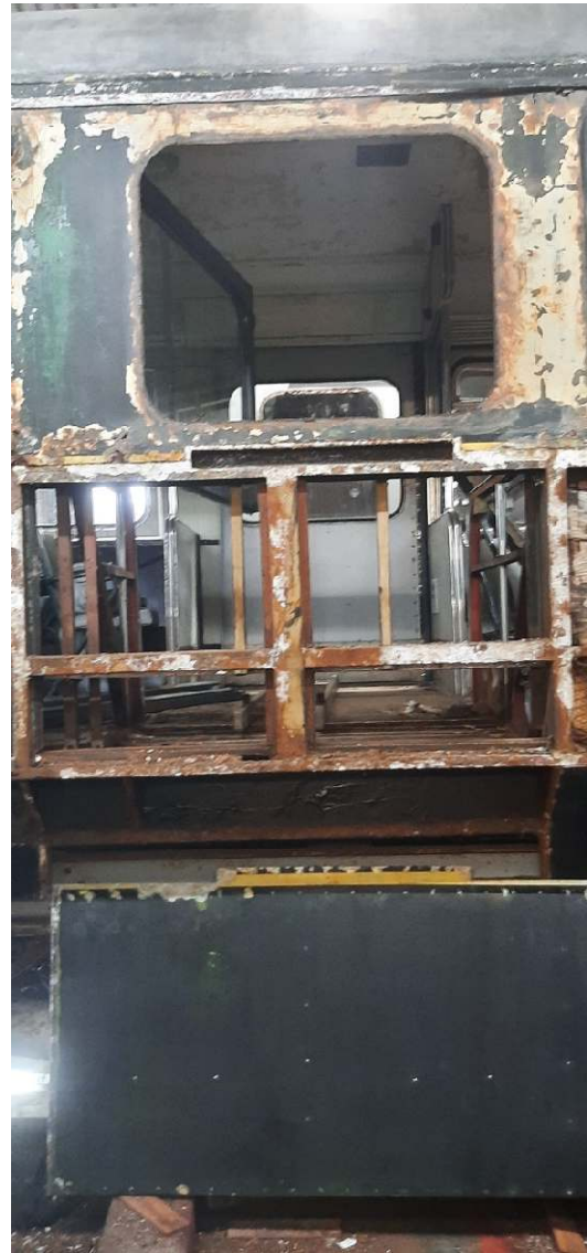
Lower exterior panel and window removed