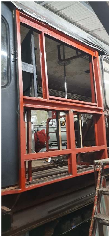
Frame repairs complete and primer painted.