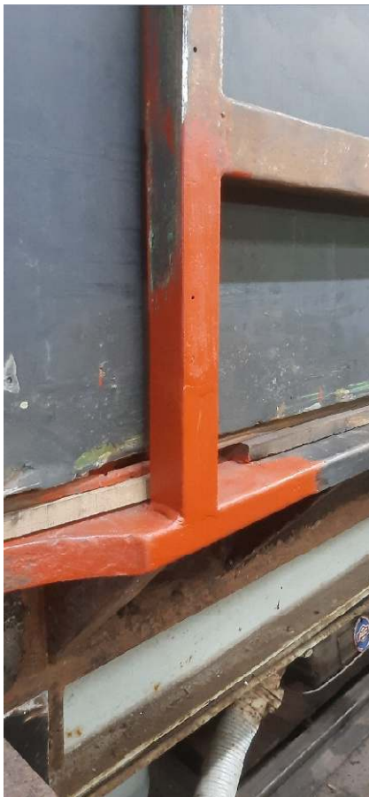
Final section of door runner support plate fitted, also repaired section of outer door post and doorstep.