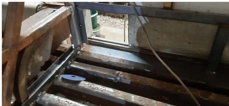
And from the inside. Also visible are a replacement channel section for the partition and repairs to corrugated floor panel.