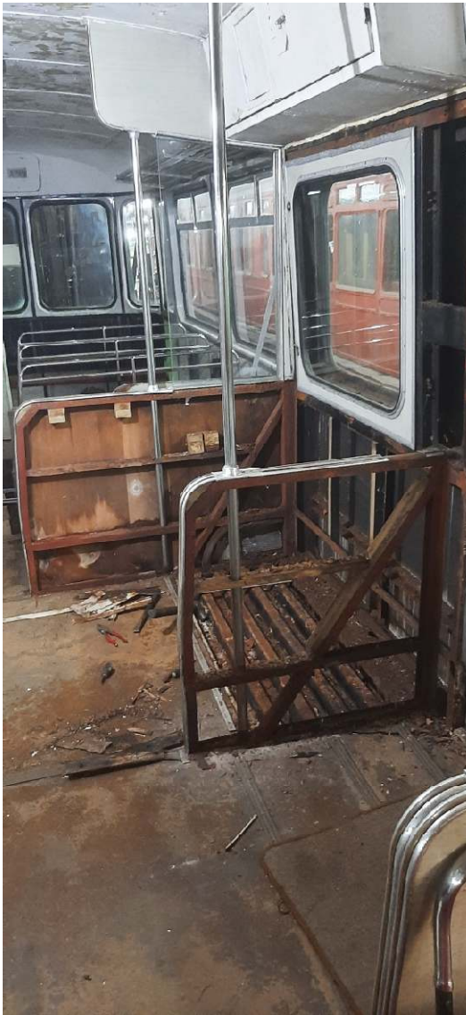
Interior partition panels and floor removal

As previously mentioned, it is planned to carry out the restoration in stages, complete a section, run the vehicle, and then move on to the next section. This way it will break the work into manageable sections and still enable occasional outings for the vehicle to hopefully maintain interest.