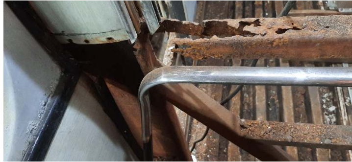
Above and below, before repair.