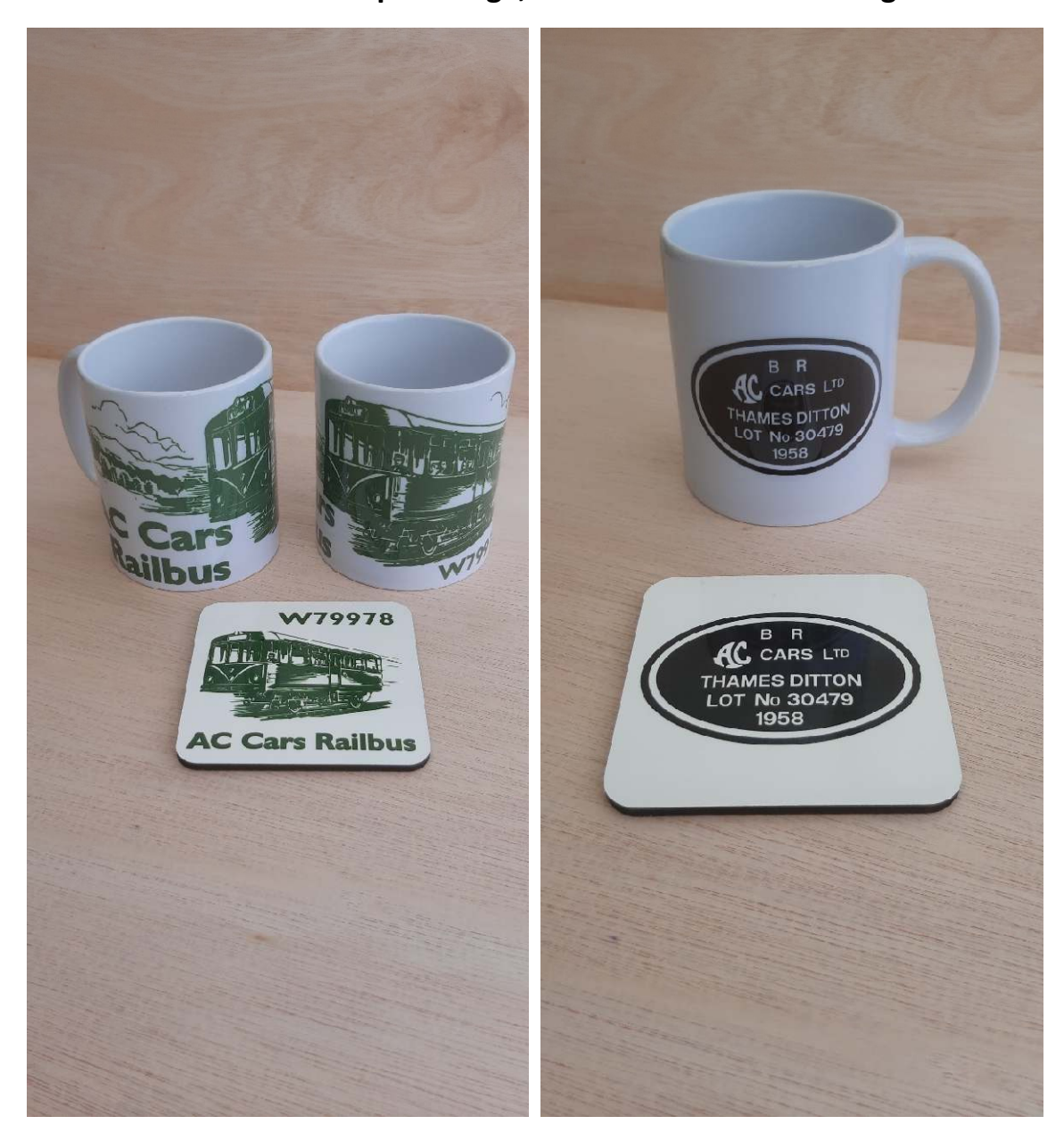
Mugs £7.50 each, Coasters £3.00 each Mug and coaster set, 1 of each any combination £10.00

In Addition to the current range of T shirts and Mugs, we now have new mugs with the Railbus builders plate Logo, and coasters of both designs.